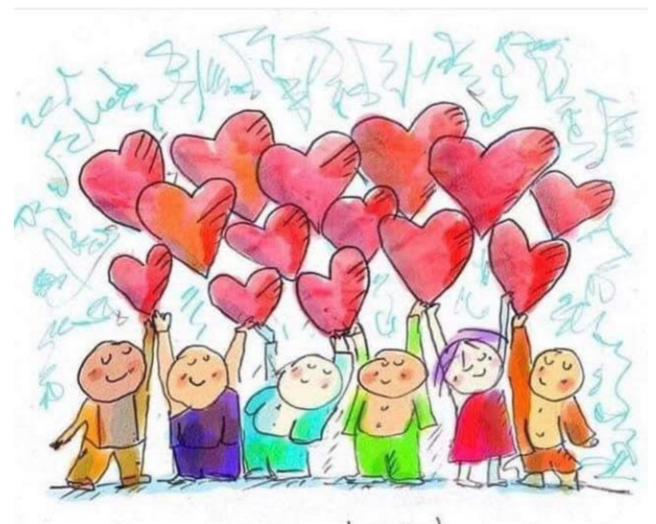
Together, we lift hearts.