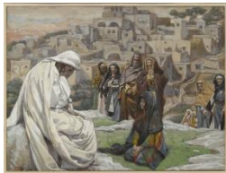
by James Tissot

And Jesus wept for he knew what was coming.