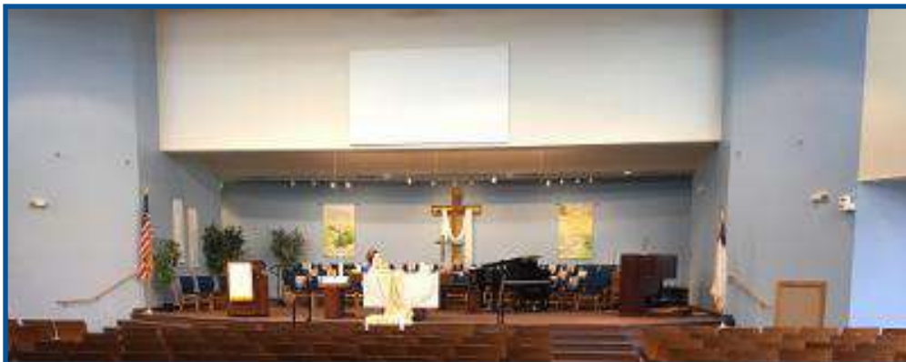
Our Beautiful Newly-Painted Chancel Walls