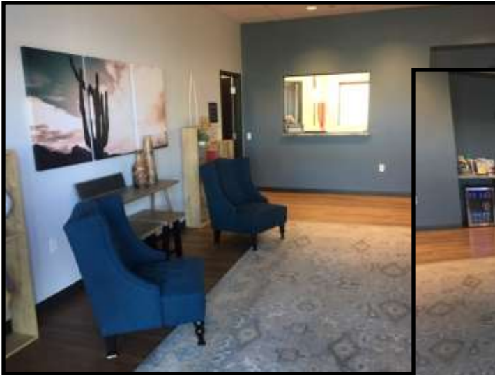
A beautiful and welcoming lobby complete with coffee service!

The Finance Committee, the Trustees and the Building Committee are synchronizing our efforts on the Nursery-Toddler's Room with the storm damage restoration work. As a result, the remodel will take place after the storm damage repairs are completed. This repair work is scheduled to commence in the immediate future and will include roof repairs and stucco repairs among other things. The storm damage repair work is being accomplished by Strategic Construction & Building Services (SCBS), a general contractor, through an insurance claim made by Vista Church to Church Mutual, our Insurance carrier.